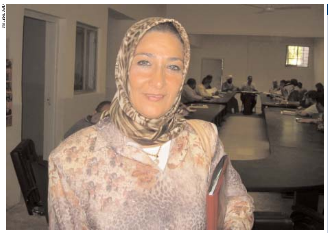
A council member stands in front of an animated meeting of a district council as it debated hiring an adminis-