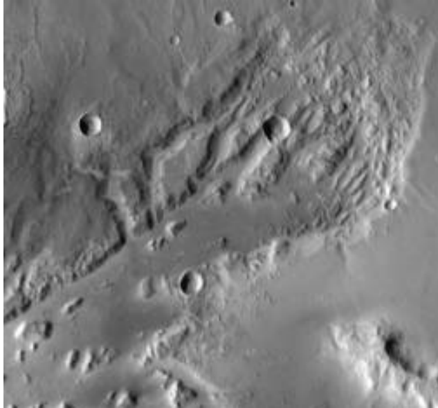
Figure 2: High-resolution (70 m/pixel) view of landing site 2 (channel floor SW of prominent crater in south-central part of image). Channel floor in this region is 15 km across.

(1993). Ha is a smooth fan shaped flow possibly composed of lava. Hcht is chaotic material interpreted as a melange of ancient highland rocks and Apollinaris lava flows. Landing sites both sit on Hchp material interpreted as channel and floodplain deposits.