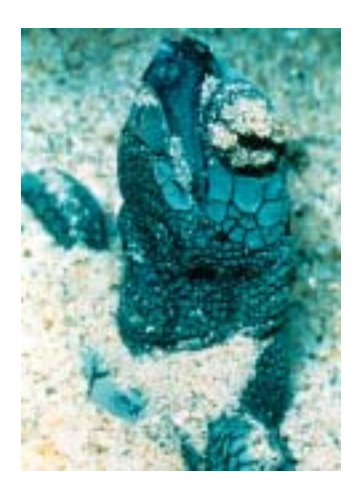
A loggerhead hatchling emerges from its nest. USFWS photo

Right: A member of the "amphibious assault" team, this female loggerhead prepares to dig her nest. USFWS photo