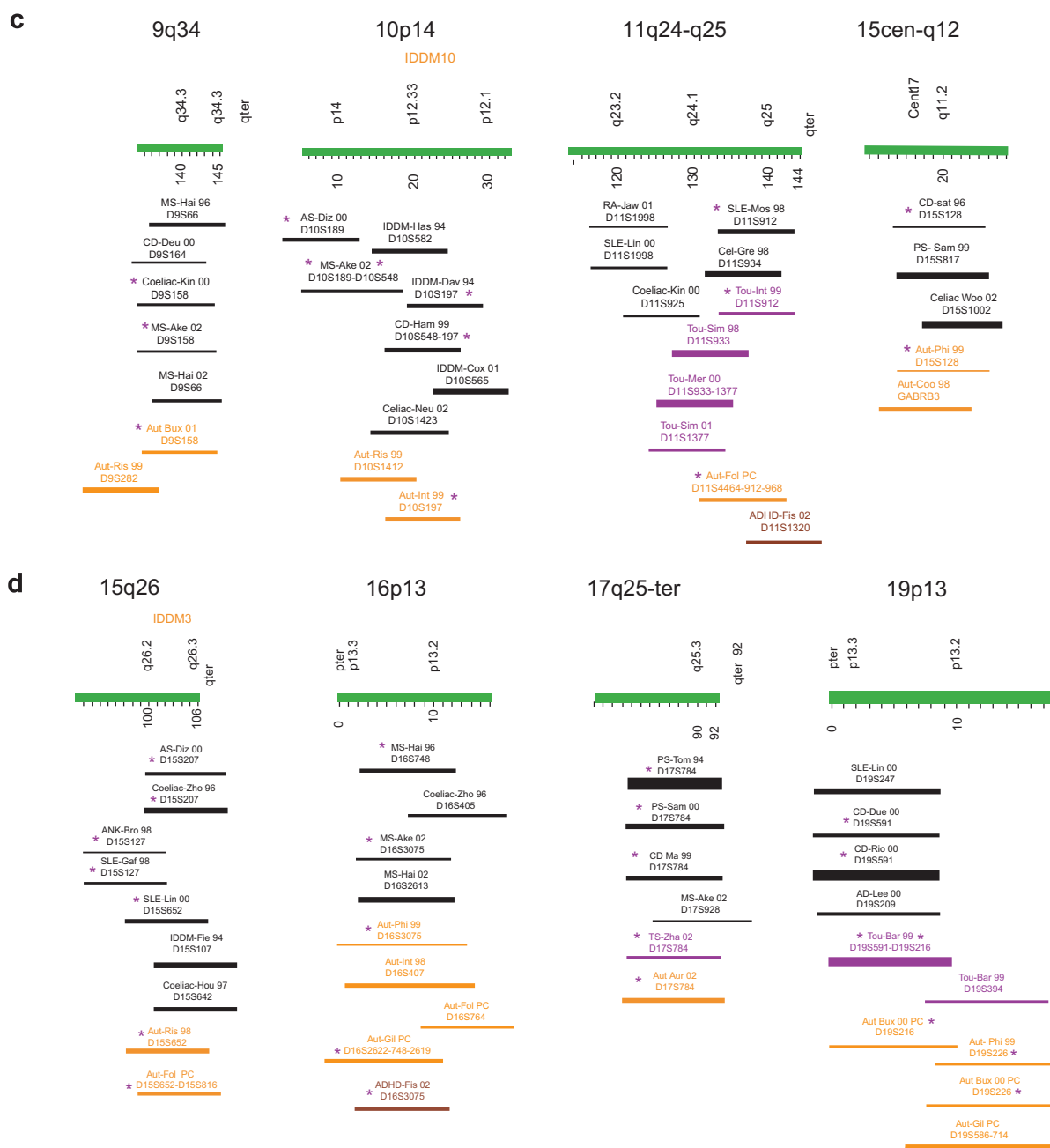
Fig. 1 (continued)

of asthma and allergies are found with early exposure to cats [107,108], being raised in a farm environment [109] larger family size [110,35] day-care attendance [111] and birth order [32–36].