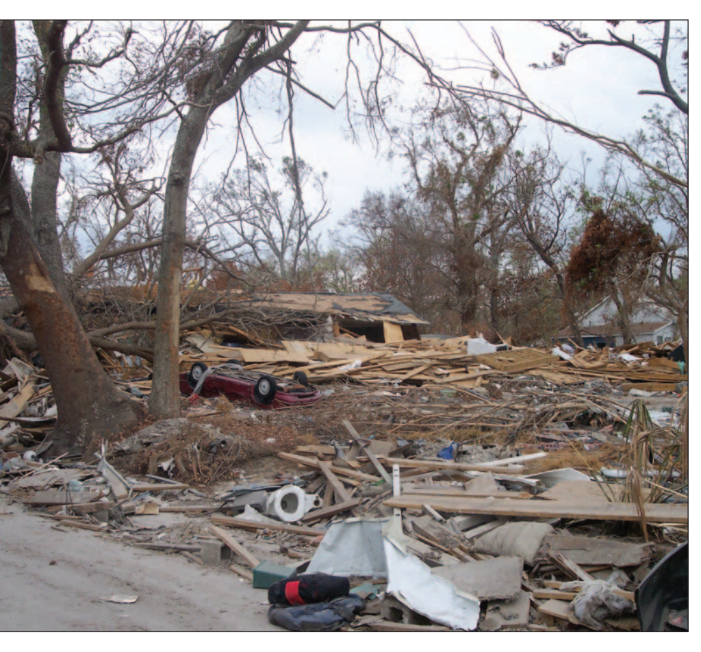
Near the beach, Biloxi, MS

In 1998, Hurricane Georges narrowly missed New Orleans, striking Mississippi and Alabama instead. Roused by the close call, local emergency-management planners began to seek federal funding for a massive exercise to consider the potential impact of a direct strike