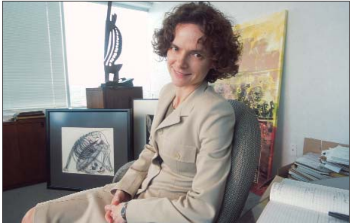
Mind reader. Nora Volkow's pioneering work on using brain imaging to study addiction made her a natural choice to guide NIDA.

Now the question in Volkow's mind is: If