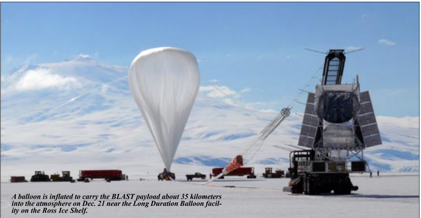
A balloon is inflated to carry the BLAST payload about 35 kilometers into the atmosphere on Dec. 21 near the Long Duration Balloon facility on the Ross Ice Shelf.