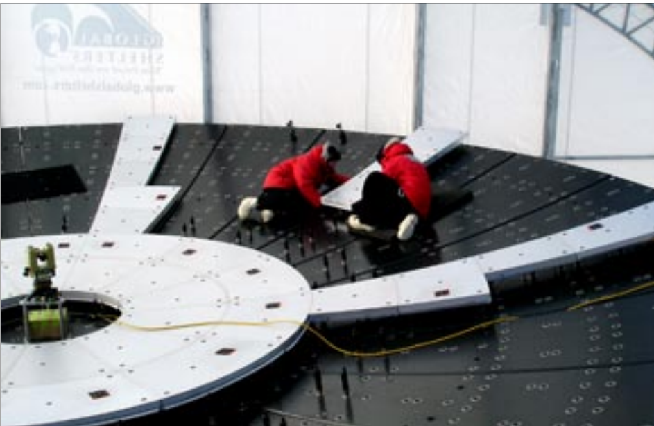
Steel construction for the South Pole Telescope is approximately 75 percent complete. Next month, the Sun will carry a full report on the construction and science behind this massive project.