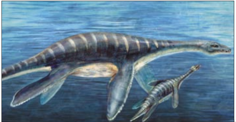
A artist's drawing depicts a young plesiosaur swimming alongside an adult. A research team discovered a near-intact baby plesiosaur fossil near the northern tip of the Antarctic Peninsula.

Martin referred to them as “some of the most advanced birds in the world from that