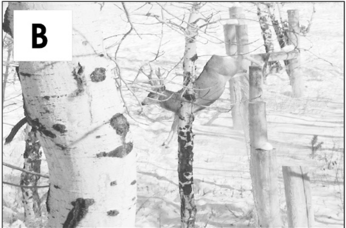
Figure 2. A, Female mule deer ( Odocoileus hemionus ) exiting exclosure through 0.5-m gap under fence. B, Large-antlered male mule deer jumping over 1.7-m tall fence.

whether food, predators (including humans), seasonal movements, or other, are important considerations in determining efficacy of a fence design (VerCauteren et al. 2006). Under the conditions of our evaluation, elk might not have been motivated sufficiently to breach our fence. Given greater motivation, we suspect more elk could penetrate our fence. Goddard et al. (2001) found that the more motivated an animal, the more substantial the fence needed to be in order to be effective. We anticipated that elk might breach the fence and we designed it so additional woven-wire could be added to the top or bottom; however, we never used this option. Our study demonstrated strong potential for this fence design, but further evaluation is warranted under higher levels of motivation and in various environmental settings.