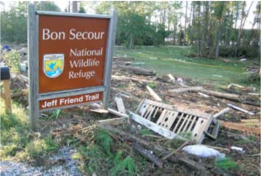
Above: Bon Secour NWR impacted by Hurricane Ivan including major debris. Below: damage to primary dunes at Bon Secour NWR is extensive. These dunes are critical habitat to endangered beach mice populations.

Bon Secour and Choctaw National Wildlife Refuges, two among fourteen Refuges and Ecological Services Field Offices impacted Thursday, September 16, 2004