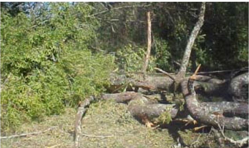
Extensive downed trees at Choctaw NWR.