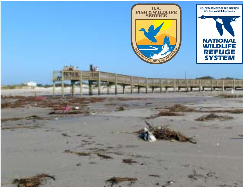
Above: missing section of boardwalk at Bon Secour NWR. Below: this refuge residence (Friend House) was condemned due to structural defects occurring from tidal surge and 2-3' water intruding through floor into the residence.