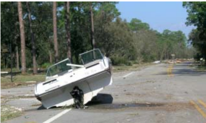
Boat on the road at Bon Secour NWR.