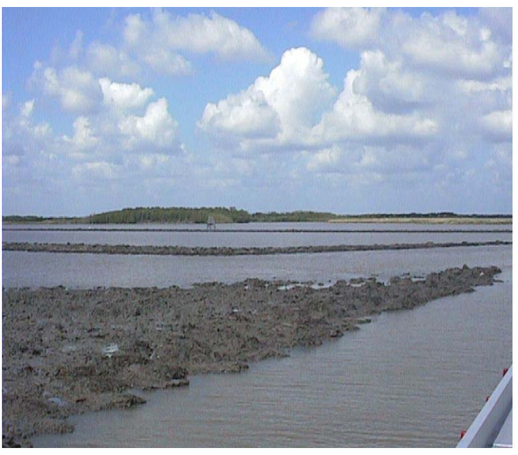
An example of the proposed terrace construction for Pecan Island Terracing.

The project calls for constructing adjacent terrace cells in a staggered gap formation, each bordered by terraces made from dredged material. Terraces will be built and planted with smooth cordgrass ( Spartina alterniflora ), and California bulrush ( Scirpus californicus ). Plantings may also occur on the north side of the terracing area.