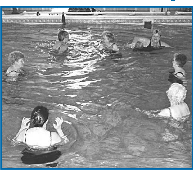
Shown above is the Arthritis Class at Olive's Aquatic Fitness Center in Elgin, Ala. The members of the Arthritis Class all understand that they need to "Move it or lose it!" and are enjoying a game of "Drop the Ball," similar to the game "Drop the Handkerchief" that we all played in our childhood.

Therefore, it is IMPERATIVE that individuals check with their doctors before engaging in any kind of water exercise. For many patients, water-based exercises should only be per-