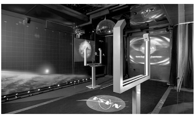
tually "walk" on the surfaces of the moon and Mars before returning to Earth.

A three-dimensional theater features a presentation on the Vision for Space Exploration, with a "window" to a journey to otherworldly destinations. You'll experience environments in other parts of our solar system, and then vir-