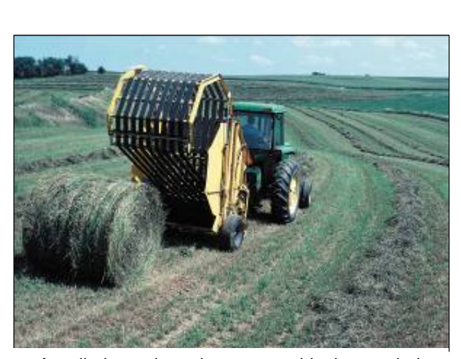
A well-planned rotation can provide the needed grain and forage for a livestock operation as well as a cash crop.