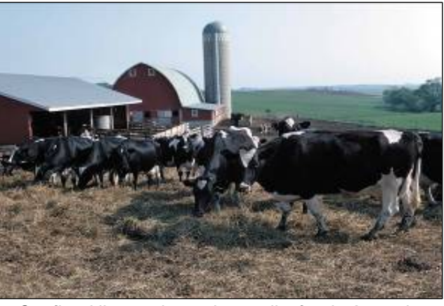
Confined livestock require quality feed. A rotation designed to fit your livestock operation can provide the feed with little or no off- farm feed purchase.

Generally there is no capital cost to establish the rotation. However, time may be required to plan and maintain the rotation best suited for your needs.