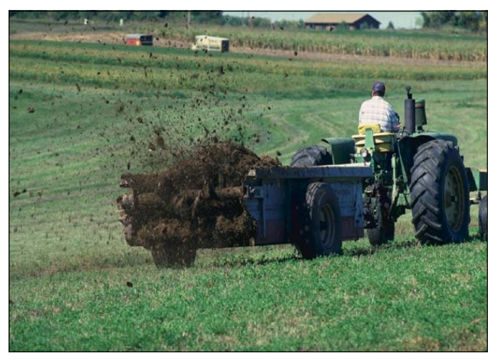
Multiple crop rotations can better utilize manure for nutrients