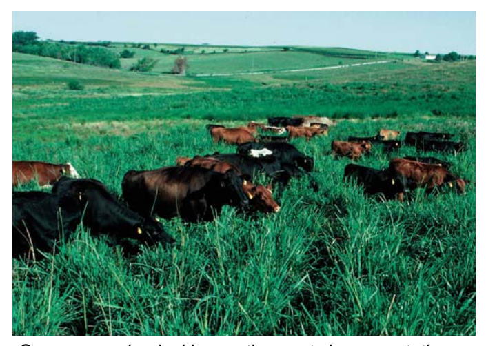
Save on mechanical harvesting costs in your rotation with proper fencing, species selection, and timing to allow livestock to directly graze the forage.