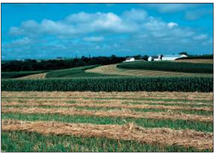
Rotations can be designed to provide the mix of grain and forages needed for the farm operation.