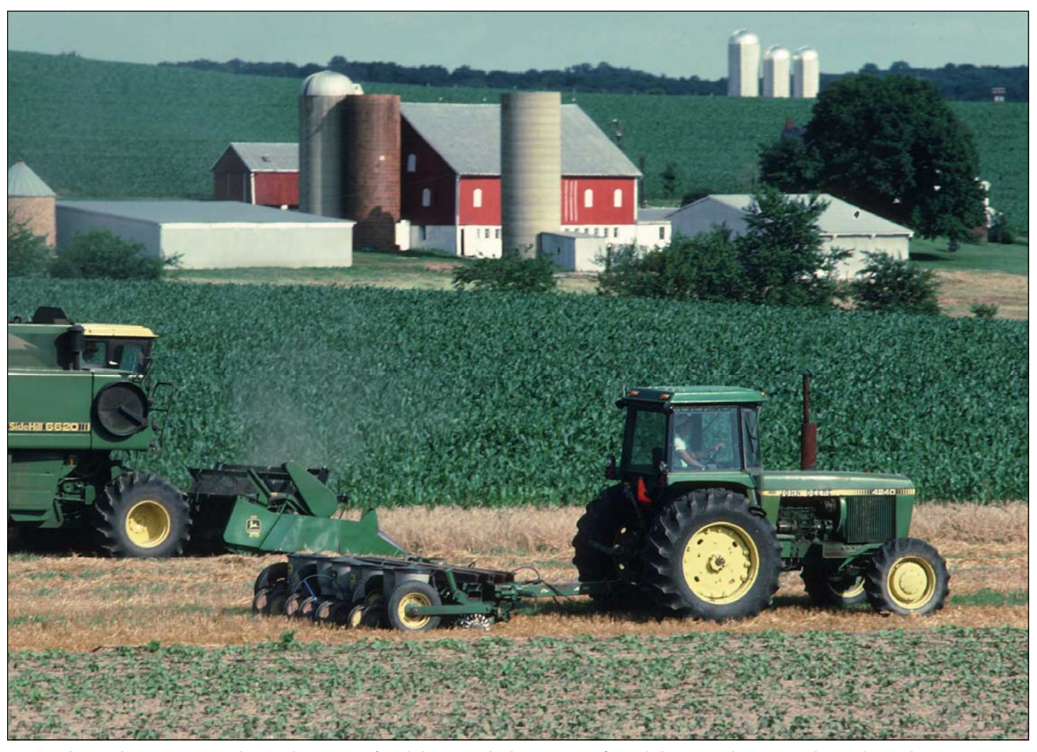
A rotation can not only produce your feed, but can balance your farm labor requirements throughout the year.