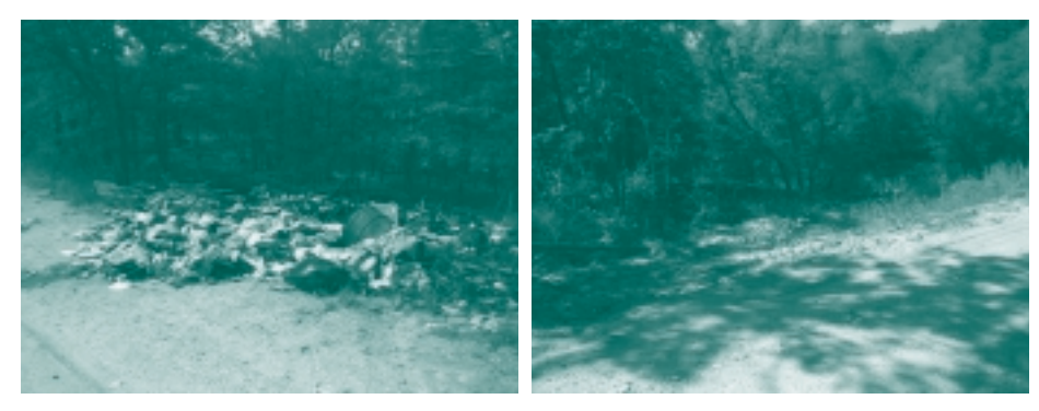
Before and after shots at Seminole Nation demonstrate cleanup project success.

One of the first steps in the cleanup process is identifying and inventorying existing illegal dumps sites. This initial count serves as a baseline by which to measure cleanup progress. Establishing a baseline allows you to