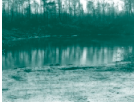
Before and after shots spell success for a White Earth cleanup project.

site controls and a long-term main-tenance plan.