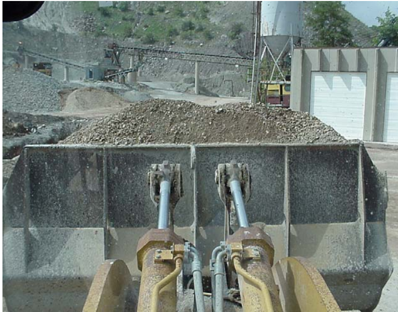
View from Operator's Cab