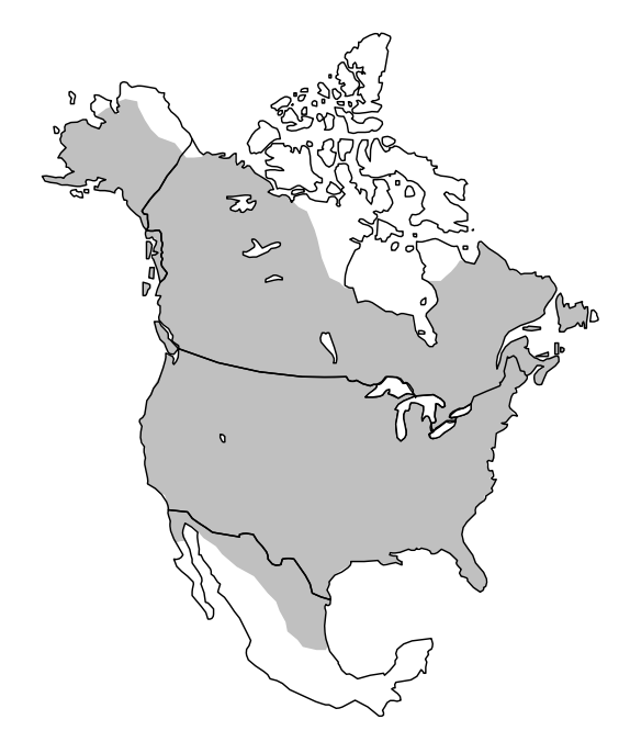
Figure 1. Range of American robin in North America.

The American robin has also been sighted as a rare vagrant in several European countries. It is extremely adaptable, occurring in a wide array of ecosystems and ascending to 3,500 meters in Mexico. Its far-ranging distribution and variable forging habits are shared with few other birds in North America (Sallabanks and James 1999).