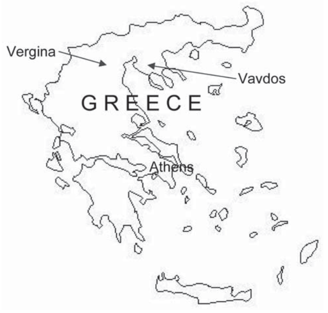
Figure 2. Map of Greece showing location of Vergina and Vavdos villages.

Natural foci of GGE virus are present in northern Greece. The strain that circulates in Greece resembles that