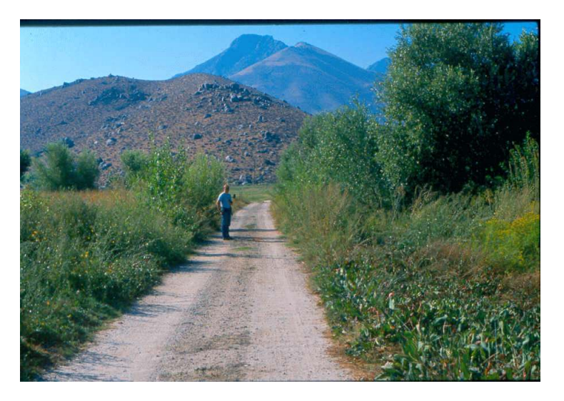
Figure 5. Kern River Preserve driveway in 1988 following about 6 years of no grazing.

property during April and June were about 2,700 and 2,400 pounds/acre, respectively.