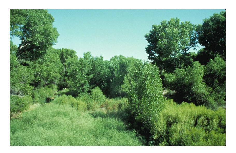
Figure 2. Photopoint 22-B, San Pedro Riparian National Conservation Area, July 6, 1992, after five years of no grazing.