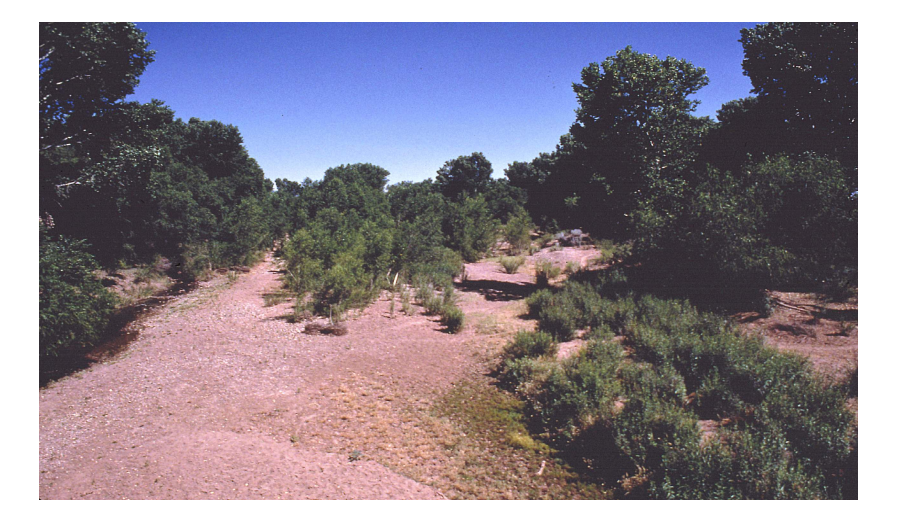
Figure 1. Photopoint 22-B, Highway 90 and San Pedro River, San Pedro Riparian National Conservation Area, July 4, 1987.

occupancy by flycatchers, what level of grazing (other than exclosure) may be compatible with the maintenance of the riparian habitat preferred by flycatchers?