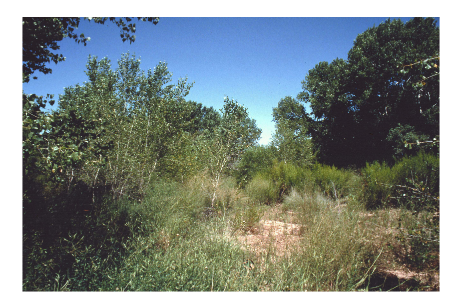
Figure 4. Photopoint 31, San Pedro Riparian National Conservation Area, July 17, 1992, after five years of no grazing.