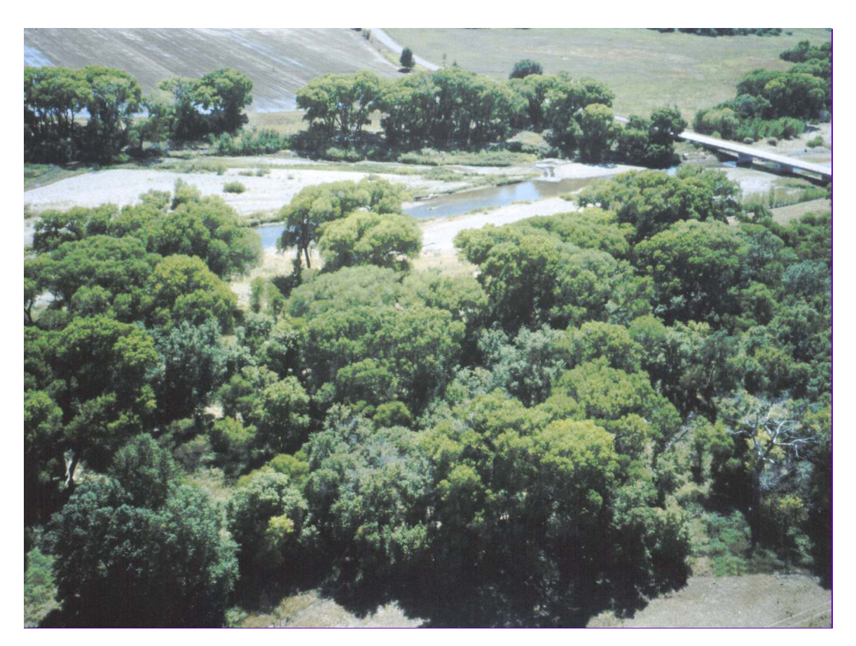
Figure 7. Cliff-Gila Valley, New Mexico, October 1998.