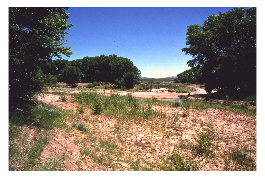
Figure 3. Photopoint 31, Greenbrush Draw and San Pedro River, San Pedro Riparian National Conservation Area, July 5, 1987.