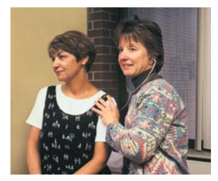
Clinical studies conducted by Dr. Sally Wenzel, shown here with a patient, found that individuals with asthma can be classified into four distinct phenotypes.

Measurement of eosinophils revealed a significant difference between early- and late-onset patients. Of the 30 late-onset patients, 19 had unusually high levels of eosinophils, whereas just 18 of the 50 early-onset patients had a similarly heightened count. That finding challenged the conventional wisdom that heightened levels of inflammation-inducing eosinophils are a