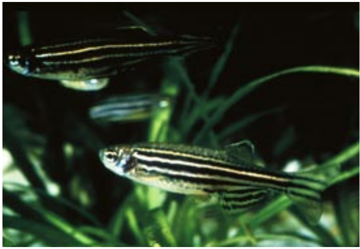
Zebrafish have embryonic and brain structures similar to humans, which makes these northern India natives useful model systems.

enormously once all our strains are there. Especially if you have a big collection of mutants, you get a lot of requests from other researchers for strains."