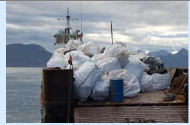
Landing craft with bags of marine debris.