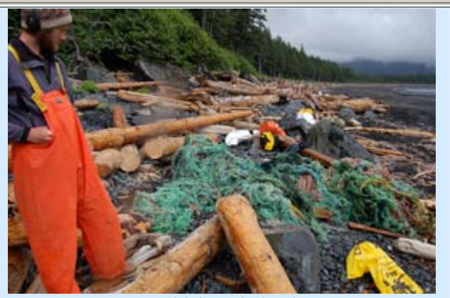
Net debris on the beach.