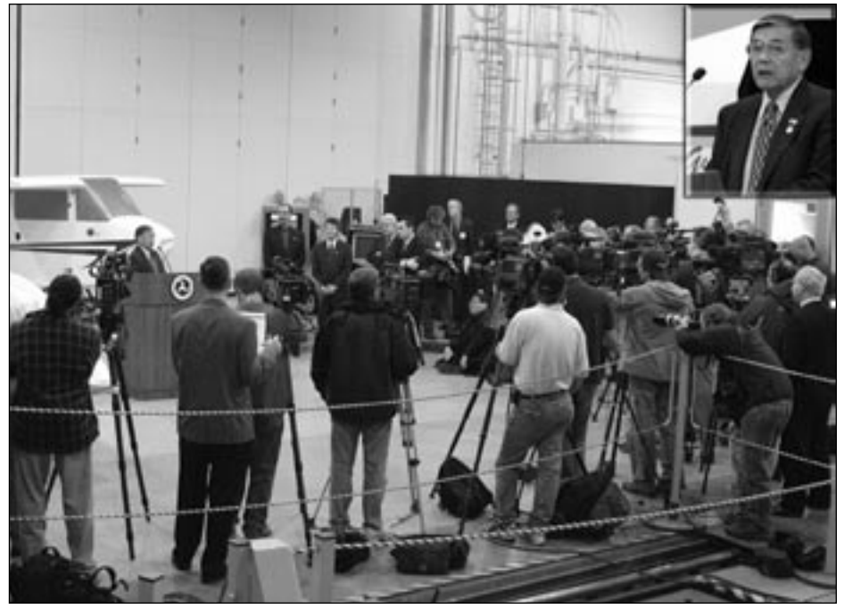
DOT SECRETARY'S PRESS CONFERENCE ON LASERS HELD AT CAMI. U.S. Secretary of Transportation Norman Y. Mineta (insert) described new federal regulations aimed to prevent incidents of cockpit illumination by lasers (story on page 13).