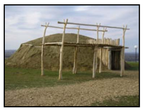
Mandan Earth Lodge

TRIBAL TERRITORY: The Mandan Tribe's historic territory was along the upper Missouri, and its tributaries, the Little Missouri, the Knife, and the Heart Rivers. They farmed the river valleys, hunted the windy plains, and made large earth-covered lodges in the valleys. The Mandan are known for being the first tribe to settle down in present day North Dakota; followed by the Hidatsa, and Arikara.