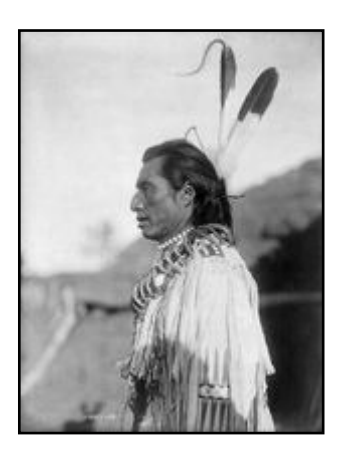
Mandan, circa 1908

The Mandan tribal heritage goes back many centuries. Around 900 A.D. a group of Indians reached what are now the plains of South Dakota. Originally from the east coast and southeastern regions of the North American continent, they began to move slowly northward over the years, following a path that generally paralleled the Missouri River. Being farmers, they chose to build their villages near the fertile flood plains of the river. About 130