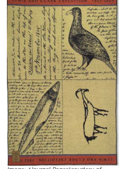
lmage: "Journal Pages"

August 17, 1806 Lewis and Clark pay Charbonneau, bid farewell to Sacagawea, and leave the Knife River villages. Floating quickly downstream (up to 80 miles a day), by Aug. 20th the Corps crosses what is now the state line between North Dakota and South Dakota. They arrive in St. Louis Sept. 23rd.