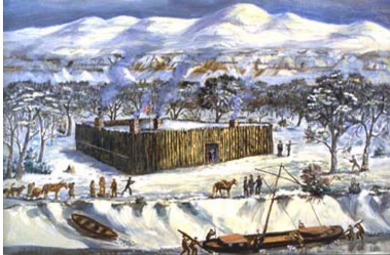
In October of 1804, the westbound Lewis and Clark expedition, also known as the Corps of Discovery, was making its way up the Missouri River when it reached the earthlodge villages of the Mandan and Hidatsa tribes. Their hospitality allowed the Corps to construct Fort Mandan across the river as a winter refuge.

Native American homelands in North Dakota crossed by the Corps of Discovery belonged to: the Hunkpapa and Yankton bands of the Sioux tribe, and the Arikara, Mandan, Hidatsa, and Assiniboine tribes.