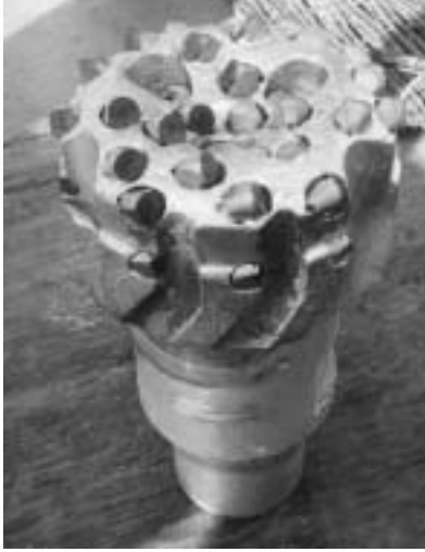
Figure 2. PDC test bit.

instances of this failure mode in Phase 2 than Phase 1, in spite of the longer drilling interval. The swivel problem was more surprising, because this equipment is commonly used for directional drilling in many locations, and the swivel is off-the-shelf equipment. There were fewer swivel problems in Phase 1 than in Phase 2, although the reason for this is unclear. Sandia is working with industry to improve this system for follow-on testing.