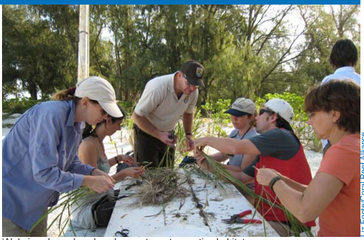
'Alakai workers clone bunchgrass to restore native habitats.

"We were struck by the remarkable abundance of life — more than a million albatross, teeming schools of fish, and healthy coral reefs — interspersed amongst the remains of military bases, battles, and gun batteries. We were struck by the remarkable