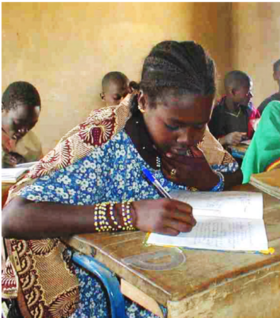
The AGSP will enable more girls to progress from one class to the next (grades 4-6), encourage higher school attendance and contribute to an improved environment for

Ambassadors' Girls' Scholarship Program. The first AGSP activity, managed directly by USAID/Mali, was folded into the mission's existing education project implemented by World Education. World Education then formed partnerships with the MOE, U.S. Peace Corps, and three Malian NGOs - Association Malienne pour la Survie au Sahel (AMSS) in Tombouctou, Aide à l'Enfant du Désert et du Sahel (AEDS) in Kidal, and Sahel Etude Action pour le Développement (SEAD) in Gao. Informal partnerships have also been established with the United Nations Children's Fund (UNICEF) and the World Health Organisation (WHO), to improve schools' infrastructure needs related to promoting health and hygiene for girls at school (construction of latrines and safe water points). The World Food Program will link up with the initiative in certain program schools that receive food rations to supply school canteens. The