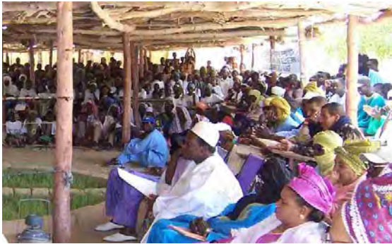
Strong community participation made the first Girls' Education Day in Tombouctou a success.

The Virtual Training Centers are expected to build capacity at six teacher training institutions for their 180 institute staff (as master trainers), as well as all the pre-service student teachers in those institutions. The estimated number of student teachers in these institutions is not yet available.