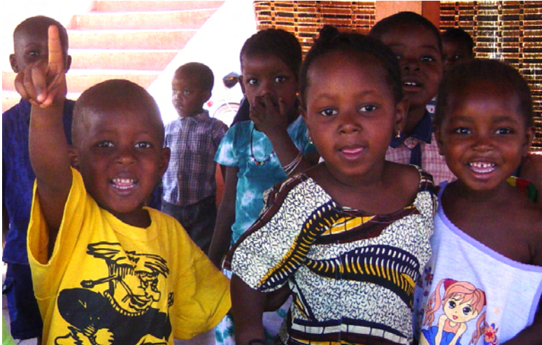
AEI in Mali is contributing to the Government of Mali's objective of making 10,000 more Malian children literate by 2007.