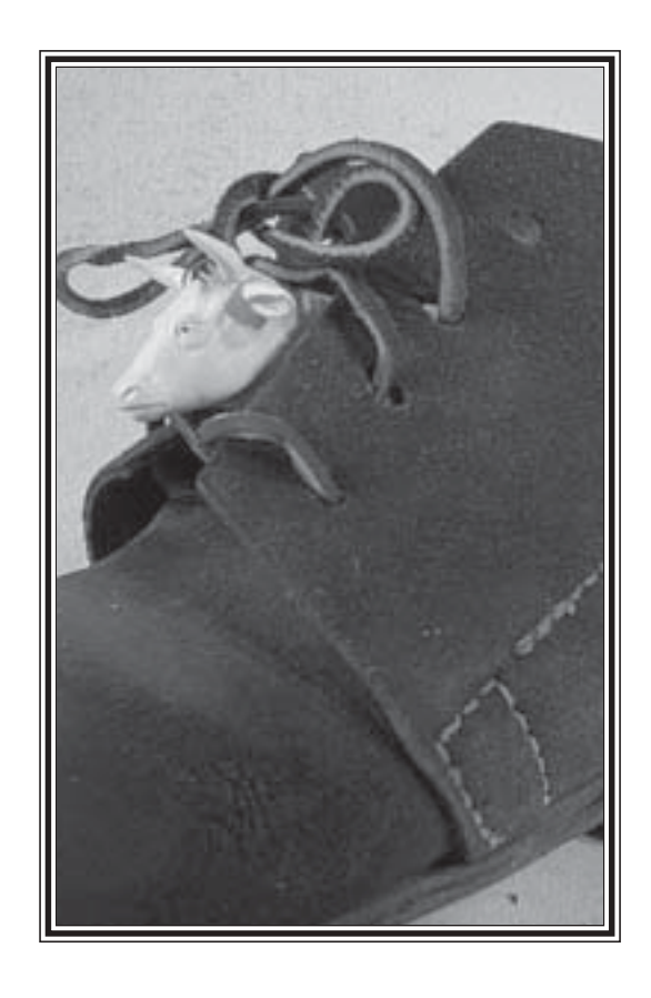
Shoes, Ships, and Survival