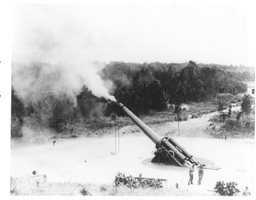
Battery Kingman firing, 1919

The Korean War kept Fort Hancock active as a