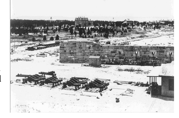
The Fort at Sandy Hook, circa 1880