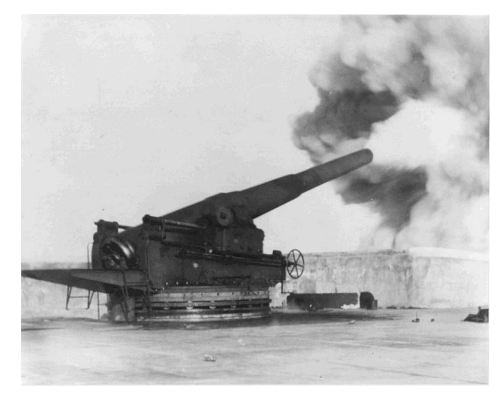
Battery Potter firing, circa 1893

After the Civil War army engineers spent years trying to devise a new type of fortification that could resist rifled artillery and protect America's harbors against large and powerful European navies. In 1890, the United States introduced the concrete gun battery, which mounted the most modern and powerful cannons of the day. These gun batteries were designed to blend into the seashore environment for protection and camouflage.