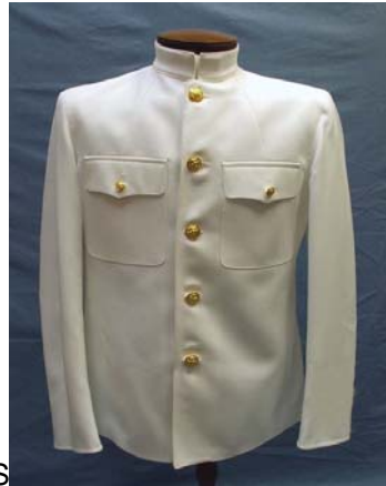
COAT, WHITE, SERVICE DRESS