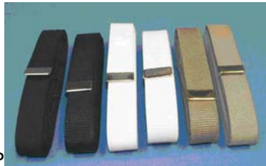
BELTS, WITH ANODIZED CLIP