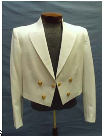
JACKET, WHITE DINNER DRESS