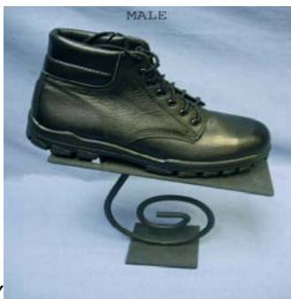
SHOES, BLACK SAFETY