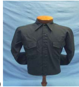
SHIRT, BLUE, WINTER, LONG SLEEVES (Phase Out 1 August 2009)