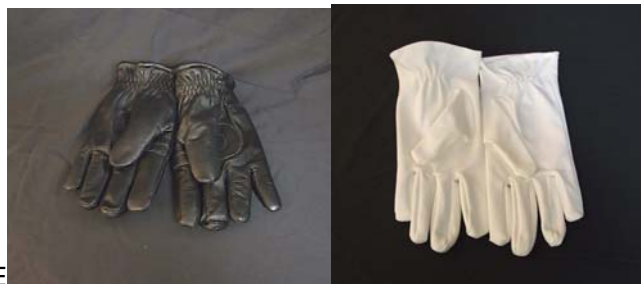
GLOVES, BLACK OR WHITE