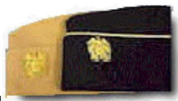
CAP, GARRISON, KHAKI