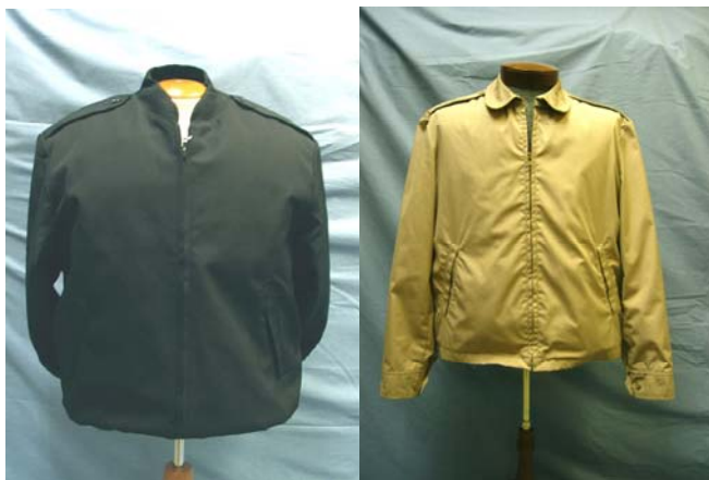
JACKET, WINDBREAKER (BLACK or KHAKI)