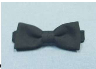
NECKTIE, BLACK BOW