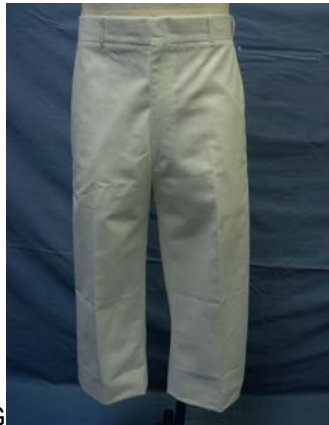
TROUSERS, WHITE LONG