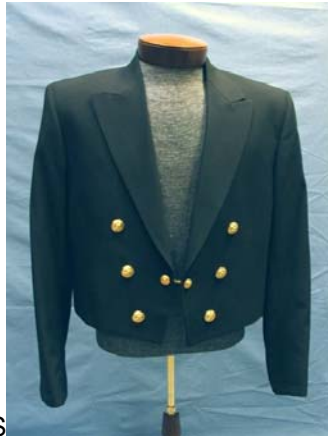
JACKET, BLUE DINNER DRESS