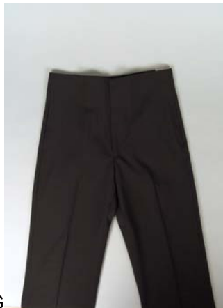
TROUSERS, BLUE EVENING