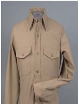
SHIRT, KHAKE, WORKING, LONG OR SHORT SLEEVES (Phase Out 1 August 2009)