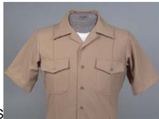
SHIRT, KHAKE, SHORT SLEEVES