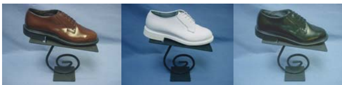
SHOES, DRESS (BROWN/BLACK/WHITE)