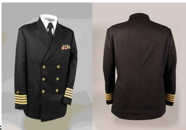
COAT, BLUE, SERVICE DRESS