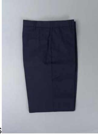
TROUSERS, BLUE DRESS