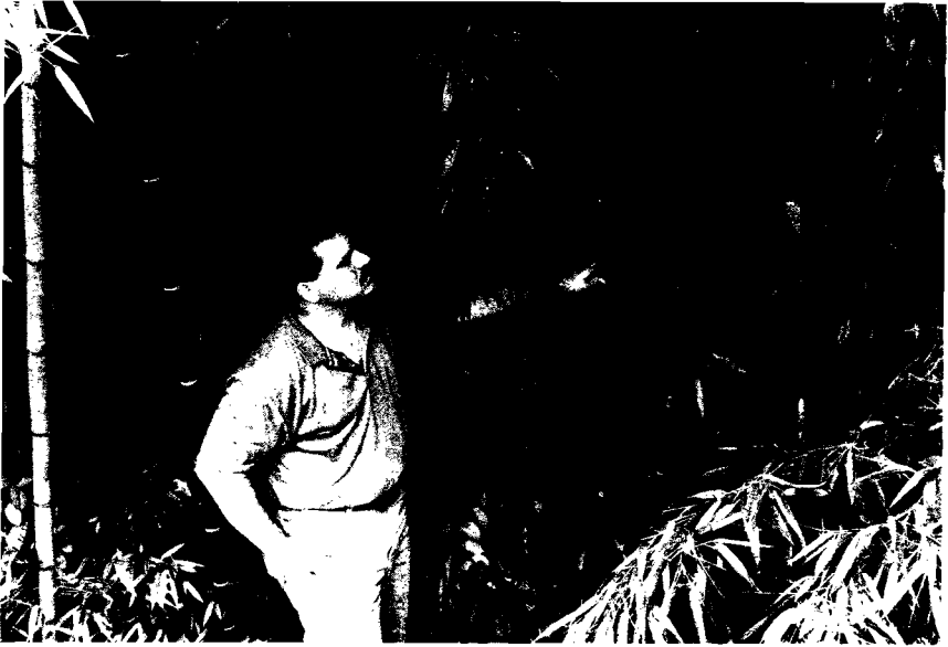
FIGURE 2. Cultivated bamboo ( Phyllostachys sp.) at the Auburn Agricultural Experiment Station, Camden, Alabama and typical of that used as blackbird/starling roosting habitat.

sidering the potential decrease in attractiveness of most habitat types due to succession or destruction from over fertilization with bird droppings, cane may be one of the few habitats that can sustain this extended period of bird use.