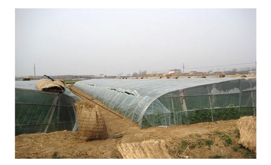
Photo 1: Typical plastic shed used for strawberry production in Shandong Province.

Frozen Strawberry Production Increased after the EU Lifted its Anti-Dumping Duty Frozen strawberry production is forecast at 147,000 MT in 2009, a seven-percent increase over the revised 2008 figure of 136,500 MT, which is up 13 percent from the previous year. 2007 production is also revised up to 120,500 MT from the previous 89,300 MT. The increases are mainly attributed to China's win in its anti-dumping case against the European Union (EU). On April 17, 2007, the European Commission (EC) lifted its temporary antidumping duty on China's frozen strawberries and set minimum import prices instead. China's frozen strawberry products will not be subject to anti-dumping duties if import cost and freight prices are higher than U.S. $765.00/MT (HS Code: 08111011), U.S. $872.00/MT (HS Code: 08111019), and U.S. $921.00/MT (HS Code: 08111090), respectively. In 2007, the average import price was U.S. $1,040.00/MT. The EC imposed a 34-percent temporary anti-dumping duty on China's frozen strawberry products on October 18, 2006 following a complaint from Poland, also a major strawberry producing country. Most frozen strawberries produced in China are processed for export and the EU is the largest export market, representing more than 50 percent of the total volume of exports.