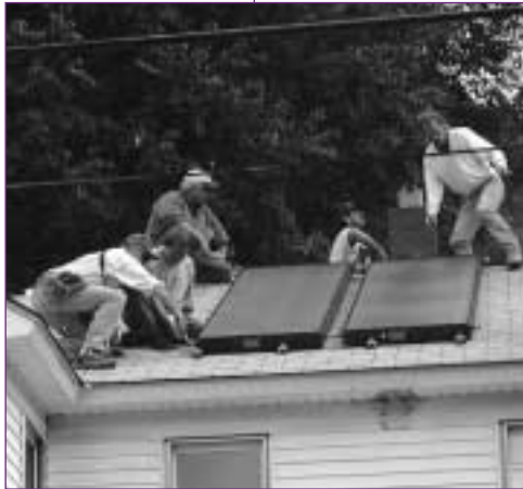
Weatherization crew installs a solar hot water system in a low-income Pennsylvania home.