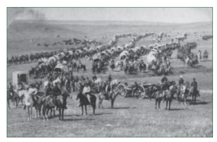
Custer's forces during their Black Hills expedition in 1874.

Custer's announcement triggered not only the Black Hills Gold Rush, but gave rise to the lawless town of Deadwood, site of the Homestake Mine. Deadwood attained notoriety for the murder of Wild Bill Hickok, and remains the final resting place of both Hickok and Calamity Jane. During the