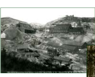
(Above) Homestake Gold Mine in 1877. (Right) Placer miners in Black Hills during the gold rush.

considered the sacred center of the world. However, some consider the claim a dubious