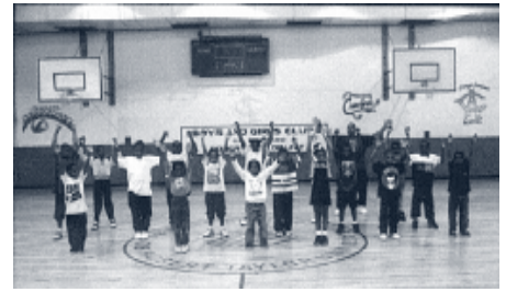
Children participate in athletic programs in the Club's six-rim gym.