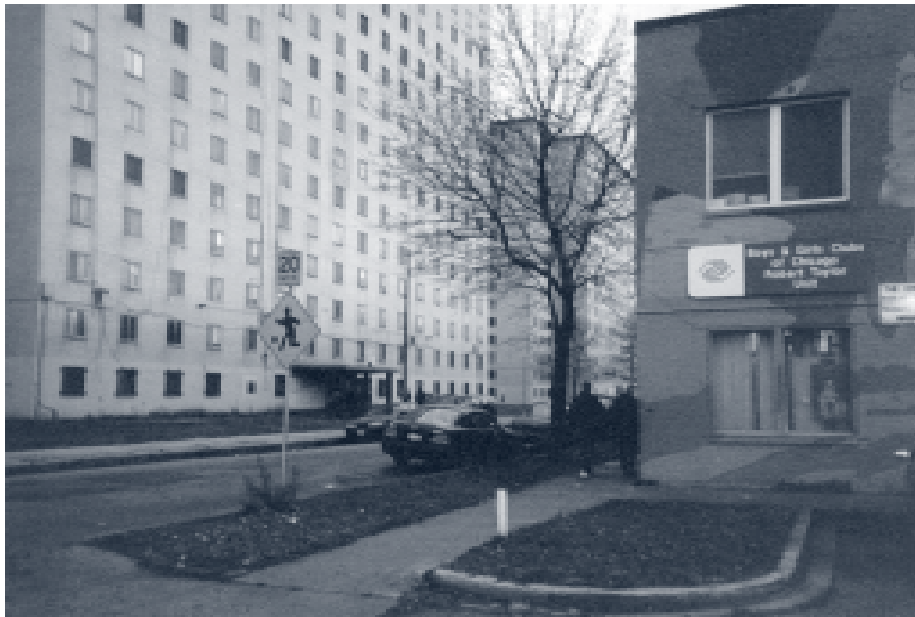
The Club building is a sharp contrast to the units that make up the Robert Taylor Homes development.

The Club receives funding from private donors and grant funding from local, state, and federal sources. The building that houses the Club is leased from the Chicago Public School System for $1.00 per year.