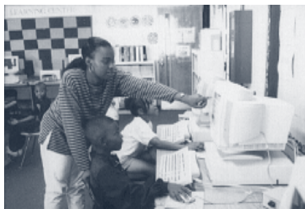
Children develop computer skills in the Club's computer room.

The younger children, ages 6–12, are allowed access to the Club from 2 p.m. until 6 p.m., and the older children are allowed to come in after 6 p.m. Director Dunkin explained the importance of separating older children from younger children. The younger children need to be protected from some of the older children's bad