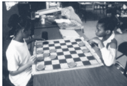
Children pass the time in a safe, warm, and learning environment.

By any standard, the Club has been a great success—as a model of cost efficiency and as a service provider to the community. With approximately 1,500 members and an annual budget of just over $325,000, all Club services are provided at a cost of less than 65 cents per member per day.