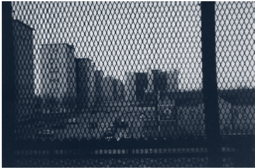
The main hallways of Robert Taylor highrises are open to the elements.

The physical conditions of Robert Taylor-B include obsolete mechanical and electrical systems, outdated elevators, leaking plumbing, inadequate security, deteriorating hot water tanks and heating riser systems, and an inadequate sanitary waste system. The building design includes open-air galleries on each floor that lead to weather exposure (a major cause of elevator breakdown) and high levels of criminal activity. 4