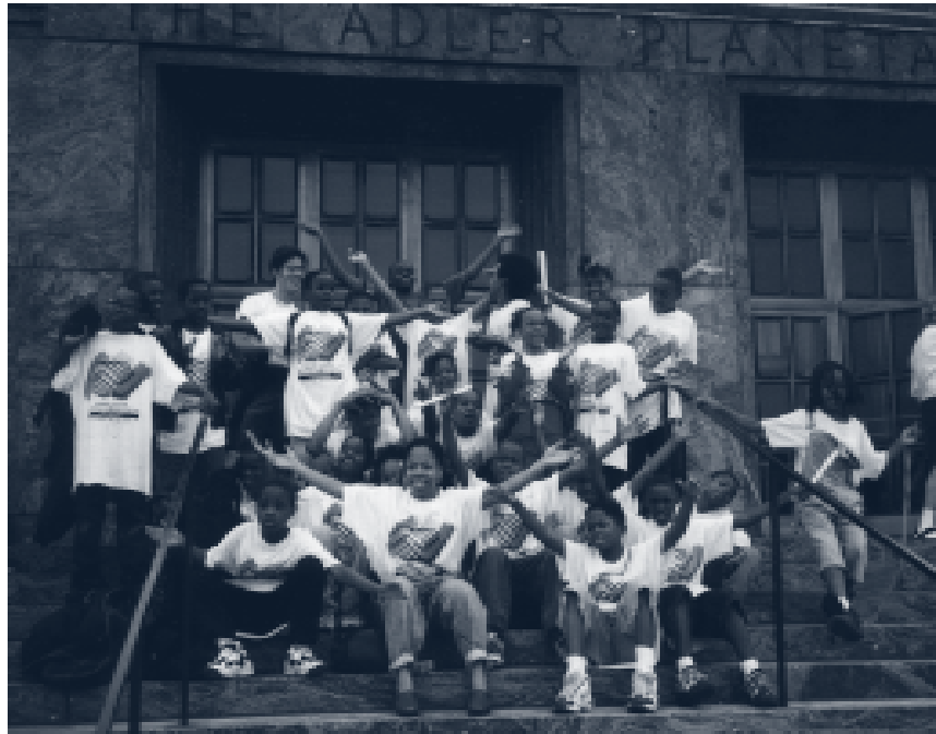
The Club exposes the children to events outside of the Robert Taylor community.