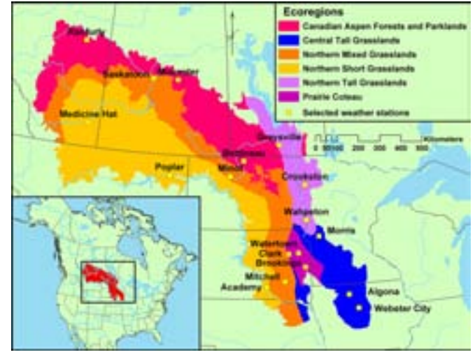
Figure 1. Location of the Prairie Pothole Region and its ecoregions in North America.