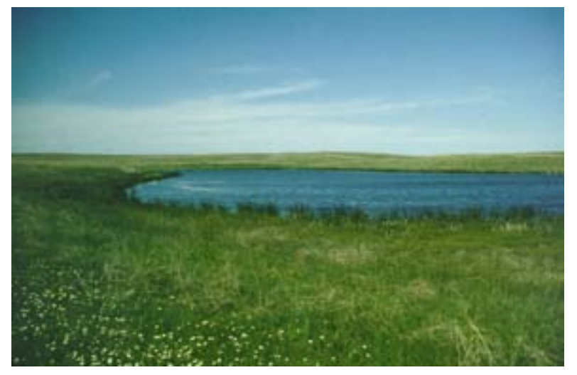
Prairie wetland in north-central South Dakota

Model simulations determined that a warmer climate of only a few degrees Centigrade increased evaporation, shortened wetland hydroperiod, increased drought frequency and duration, and produced less favorable vegetation conditions in semi-permanent wetlands for most of the PPR compared to historic conditions. Unfavorable wetland conditions developed more often in the historically drier western portions of the PPR under a simulated warmer climate.