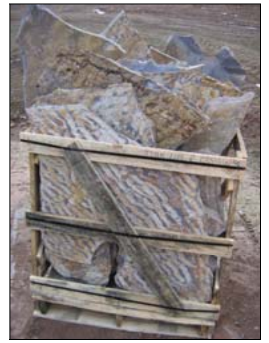
Figure 3.1-2. Flagstone Argillite in Pit 1.