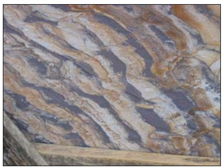
Figure 3.1-3. Flagstone Argillite with Ripple Formations in Pit 1.