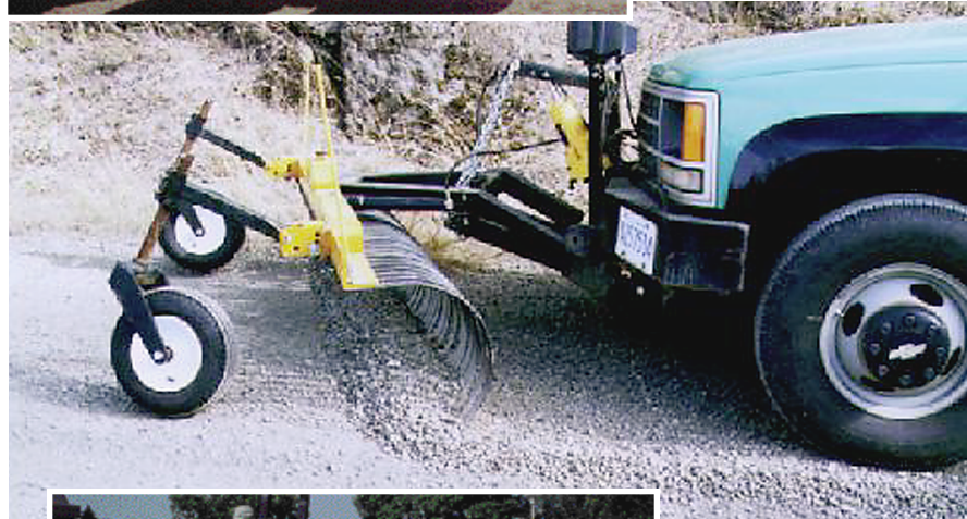
A simple front-mounted rake attachment for a pickup truck. The vehicle can be used daily for other work such as sign maintenance, either while using the rake or after the rake has been removed.

Simple blades attached to tractors have been used for a long time. But recent changes improve the concept. The device illustrated below prevents the material from spilling from the sides of the blade and allows the operator to carry enough gravel along the way to fill small pot-holes and depressions. Skillful use of these will allow the performance of many types of light maintenance, especially in tight quarters.