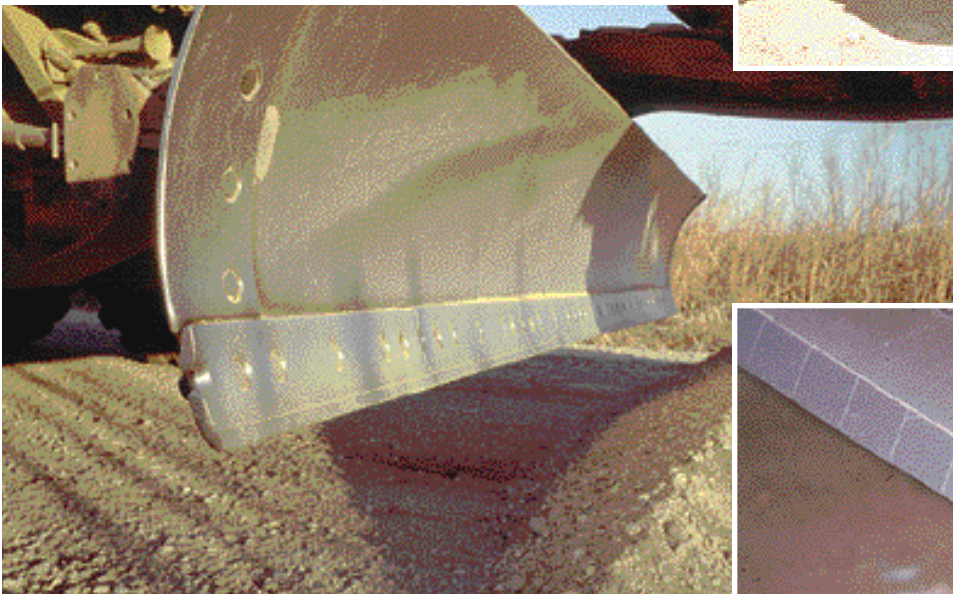
An example of a carbide-faced blade after 650 hours of use. The center sections had been exchanged with the outer sections once during this time.