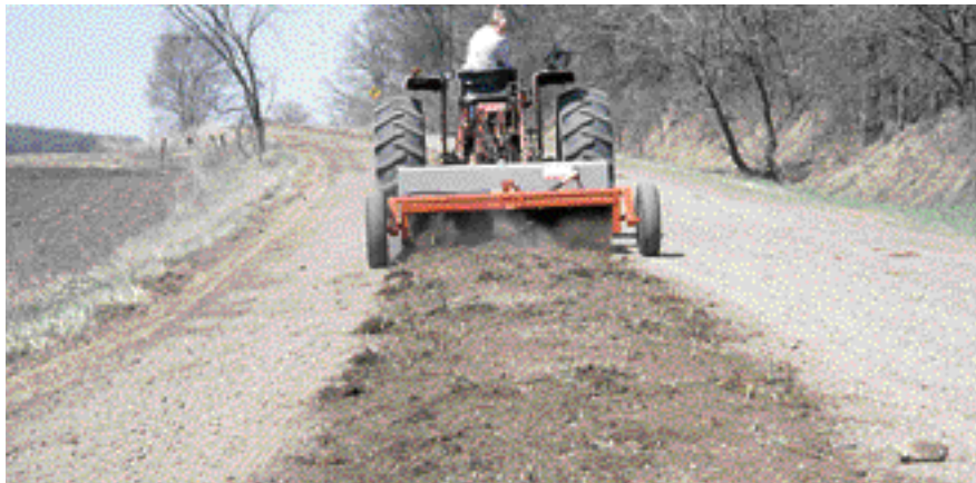
A machine made in Canada pulverizes gravel windrows into usable material on the roadway.