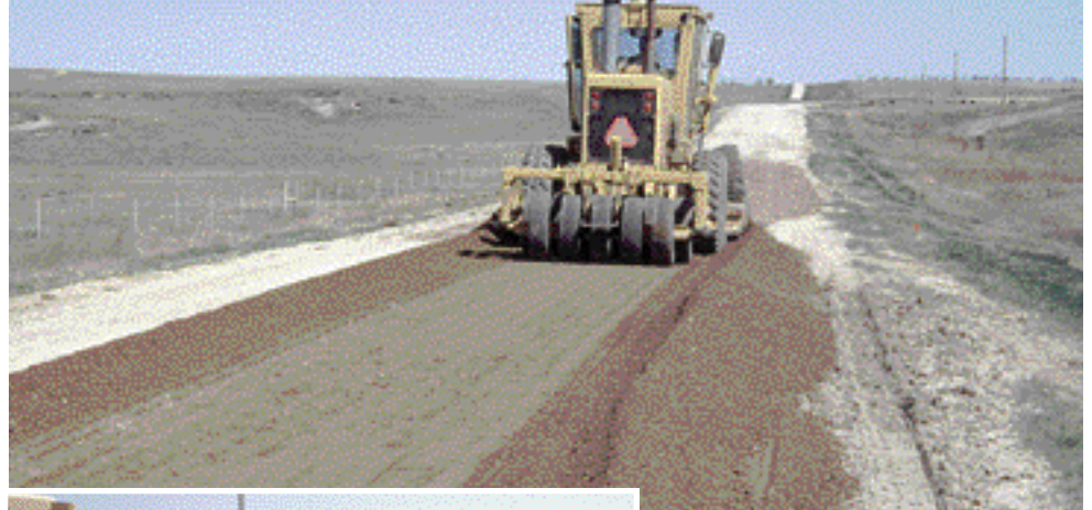
A grader-mounted roller being used on a rural gravel road. This department owns three of these units.

In some rural regions of the country where more space is available for turning and maneuvering, a grader-mounted roller may be feasible. It is an efficient way to combine blading and compaction operations when budgets are tight and extra personnel are not available. When adequate moisture is present, the use of such a machine will definitely produce a tighter and smoother surface. These can be used in routine maintenance operations as well as in placing fresh gravel.