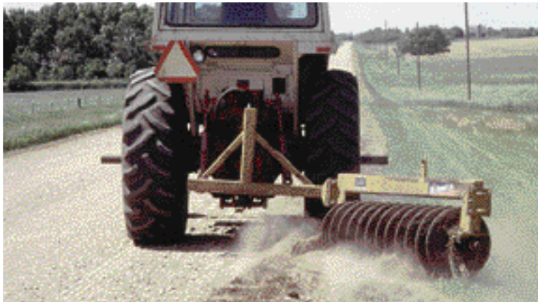
Same machine mounted on a farm tractor to help break up material on shoulder.

The use of a shouldering disk helps mulch up the sod and vegetation before it is pulled onto the roadway either to be removed or recycled on the road as reusable gravel.