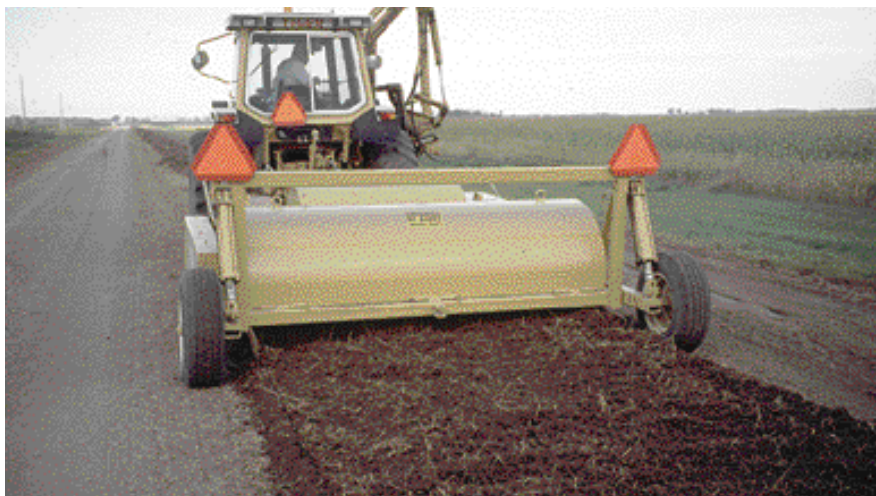
A machine fabricated specially by Hyde County in South Dakota to pulverize heavy windrows of recovered gravel and grass from the shoulder. It quickly breaks down windrows for reuse on the road.