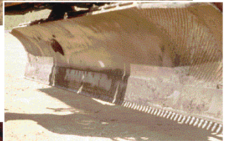
Examples of different types of replaceable bits for cutting edges.