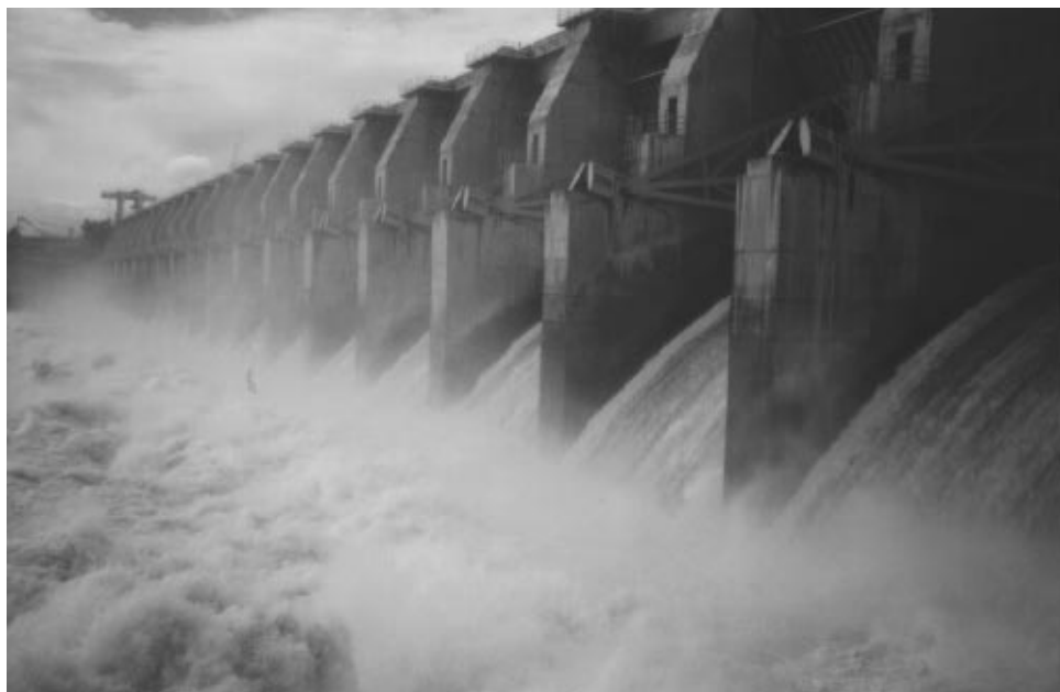
Figure 1.3: Spill at Corps' Dam on the Lower Columbia River

One operational measure designed to improve salmon passage at the Corps' dams is to spill water and juvenile fish over the dams' spillways, rather than putting the water through the powerhouses' turbines to produce electricity. However, spill has associated risks because when the water plunges into the spillway basins, it traps gases, such as nitrogen. Water that is supersaturated with nitrogen can be lethal to both adult and juvenile fish. Spillway deflectors have been installed at seven of the Corps' eight dams to limit the plunge depth of spilled water, thereby reducing the amount of supersaturated gases.