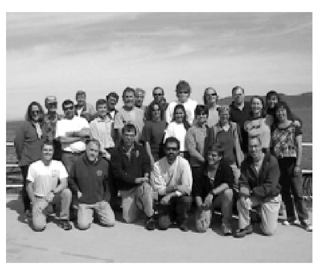
The Newport, Oregon based Astoria Canyon Research Team.

A team of scientists, led by the NWFSC and the Pacific Marine Environmental Laboratory, began mapping the undersea phenomenon of Astoria Canyon, 10 miles west of the Columbia River's mouth, to document its physical and biological characteristics. Scientists from NOAA's Southwest Fisheries Science Center and the Olympic Coast National Marine Sanctuary, Oregon State University, Washington State University, the University of British Columbia, the California Department of Fish and Game, curators from the Los Angeles County Museum, and the public aquarium and outreach center of OSU's Hatfield Marine Science Center participated in the project. This study will yield extensive data about the characteristics of an essentially untouched ocean ecosystem and allow scientists to test assumptions about how human impacts contribute to sea floor deterioration.