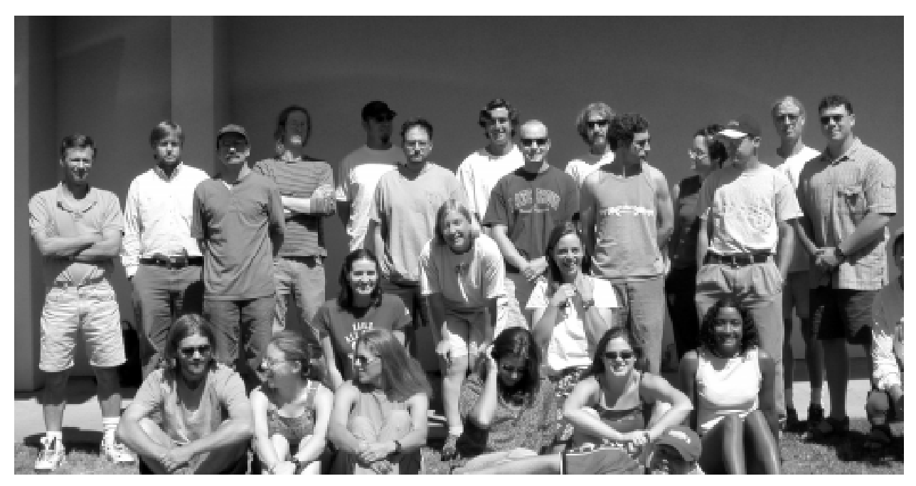
The 2001 Observer class.