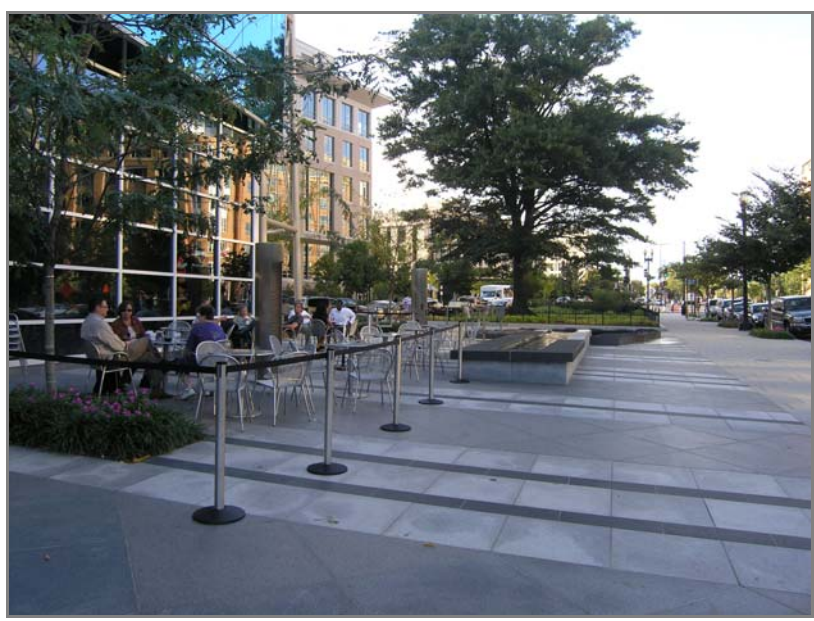
Views of Reservation 196, facing North