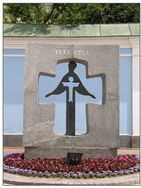
Examples of Memorials to Ukrainian Manmade Famine in the Ukraine