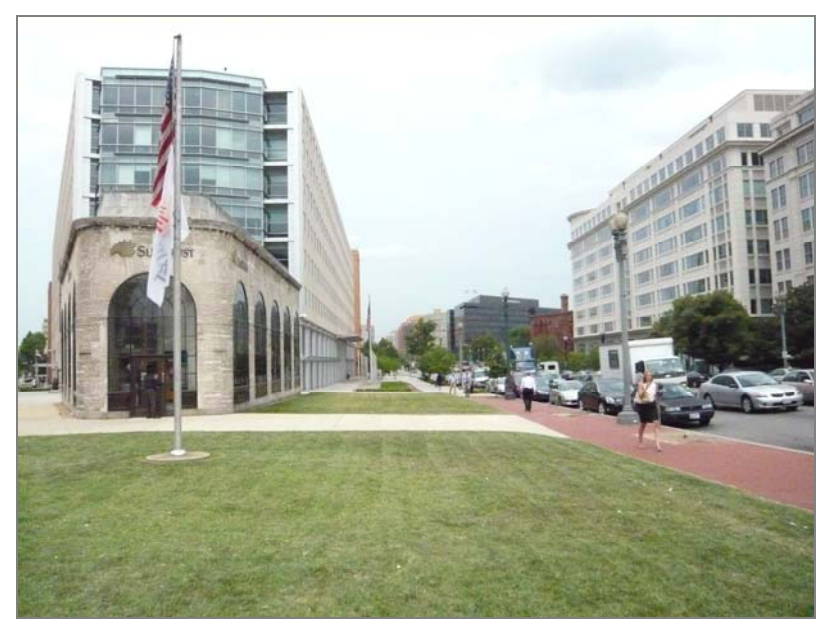
Views of Reservation 78 along Massachusetts Avenue