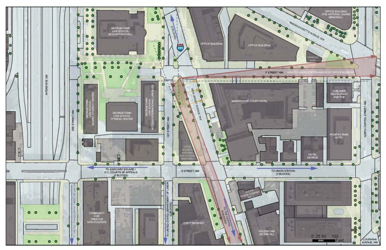
Reservation 196 sightlines

vicinity. To the immediate south of the Reservation is a restaurant and coffee shop, housed in the NAR building, and an outdoor seating area and water feature, installed by NAR and designed by Oehme, van Sweden and Associates, a notable landscape architecture firm.