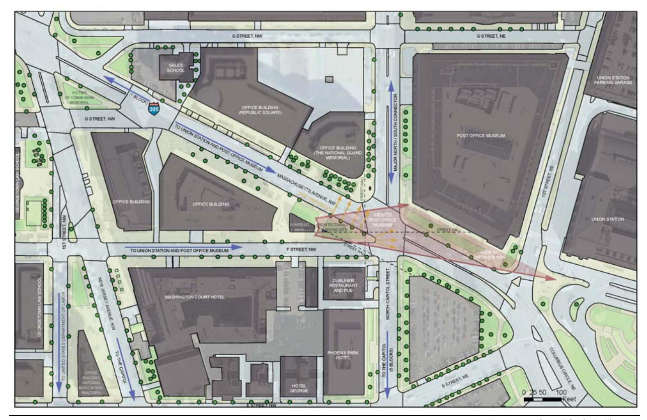
Reservation 78 sightlines

outdoor seating areas, are located directly across the street from the site to the south. Reservation 78 is one block southeast of the Memorial to Victims of Communism.