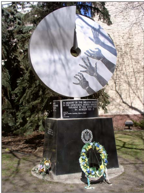
Examples of Memorials to Ukrainian Manmade Famine in Canada