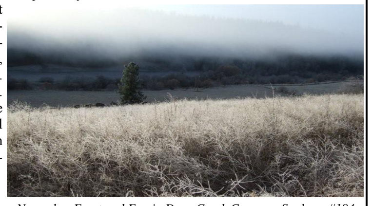
November Frost and Fog in Deep Creek Canyon - Spokane #184

Lewiston picked up 0.67" of rain while Kellogg received Overall, the Fall of 2008 was mild and dry in the Inland 0.58". Temperatures remained on the cool side before warm- Northwest. Cold weather was hard to come by and many locations still hadn't seen any snowfall by early December. In fact, Missoula, MT did not have any measurable snowfall This new warm spell lasted into early October . The 1<sup>st</sup> was in October or November, which has happened only twice in