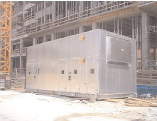
Air handler on site, prior to installation and commissioning

The Guides are available at: http://buildings.lbl.gov/hpcbs/FTG