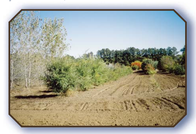
Dickinson, North Dakota Off Center Evaluation Planting (OCEP)

The Bismarck PMC has been planting a wide variety of trees and shrubs in Minnesota, North Dakota, and South Dakota since 1954. The evaluation of new species and seed sources is an ongoing process. Over the years, changing farm programs have had a big effect on the numbers of trees planted. The development of profitable crop residue management systems has resulted in fewer field windbreaks being planted.