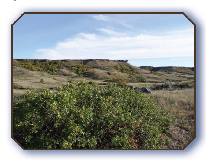
Native skunkbush sumac in the Cave Hills of South Dakota

Skunkbush sumac is a deciduous native shrub that occurs mostly west of the Missouri River. The woody plant grows on dry hillsides, preferring well-drained soils. Sumacs are dioecious, so the fruit is found on the female plants. In the 1950s, a sumac collection was made in central Wyoming. This seed source was released as 'Bighorn' skunkbush sumac. It is not widely used in windbreak plantings in our region. It does have some disease problems when moved to areas of greater precipitation. The Bismarck Plant Materials Center (PMC) and various Field Office personnel have made collections of seed from the central and western Dakotas. Most collections from North Dakota came from Dunn, Oliver, Morton, and Slope Counties. The South Dakota collections are mainly from Corson, Sully, and Lyman Counties. Once the seed is cleaned, it needs to be treated with sulfuric acid before it can be stratified to get it to germinate. The PMC will begin growing seedlings from these sources in the spring of 2008.