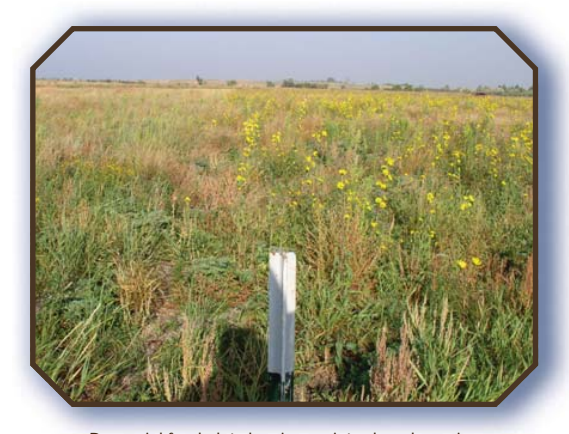
Perennial food plot showing an introduced species planting on the left and a native species on the right