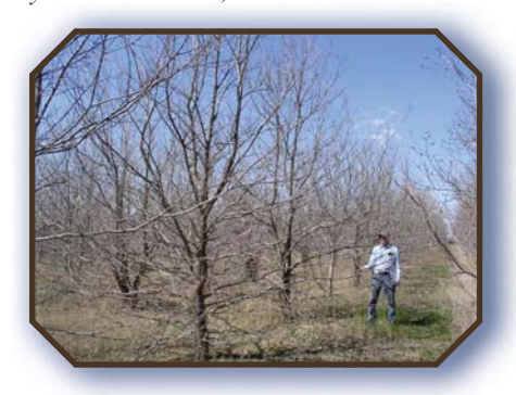
Polk County accession in Mandan evaluation

The Bismarck PMC, in the mid-1980s, released the cultivar 'Oahe' hackberry. The origin of this seed source was a shelterbelt near Gettysburg, South Dakota. About that same time, the Field Offices throughout the Great Plains began collecting seed from local seed sources of hackberry. Hackberry had been identified as an excellent substitute for American elm, which was declining due to Dutch elm disease. The ARS Northern Great Plains Research Laboratory planted seedlings from these seed sources near Mandan in 1990. The soil type on the site is predominantly a Temvik-Wilton silt loam. In 2005, a number of seed sources superior to the Oahe hackberry were noticed in the hackberry planting on the Area IV Research Farm. The best single source is from Polk County, Minnesota, northwest of Crookston. It was