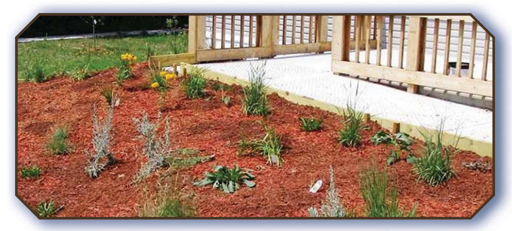
Above: Culturally significant native plants established on the Standing Rock Reservation

The Bismarck Plant Materials Center (PMC) is active in providing seed, plants, and technical information assistance to Tribes and Tribal land users. The majority of plant species provided are culturally significant. The PMC also provides seed and plants of other species for conservation purposes, including lakeshore stabilization, erosion control, and invasive species competition. Plant and seed requests are reviewed and approved by Minnesota, North Dakota, and South Dakota Plant Materials Committees. Most of the special plantings are community projects to demonstrate "how-to" onsite preparation, planting, maintenance, and harvest. Generally, special plantings are limited to 10 plants of each species. Cooperators are encouraged to prepare a clean-tilled, garden-like site, and to water and weed the plantings until they become established. Sweetgrass and white sage are rhizomatous and multiply rapidly on wellmaintained sites. Since 2002, approximately 3,300 sweetgrass plants were distributed, primarily to individual Tribal cooperators and communities.