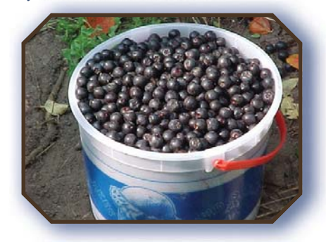
Chokeberry fruit collected at Staples, Minnesota

Black chokeberry is a cold-hardy, deciduous shrub, which is native to Minnesota. This species is sometimes known as Aronia in the nursery trade. The dark-purple fruit can be canned whole, or the juice can be used in jellies and fruit drinks. One of the larger fruit juice producers in the U.S. uses Aronia berries in its blends. Though black chokeberry is native to eastern and central North America, it has been planted extensively in Europe and Asia. In Russia, Denmark and Eastern Europe, the fruit is used for juice and wine production. The Europeans have developed several cultivars, which are now available in the U.S. from commercial nurseries. 'Viking' is a vigorous, productive variety from Scandinavia, which can grow to a height of six feet. 'Nero' is a shorter growing variety, which seems to be less hardy than Viking in North Dakota. The Bismarck PMC received the