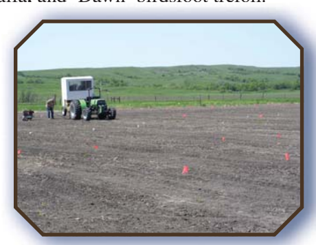
Demonstration planting at Wessington Springs, South Dakota

Grasses that were off to the best start included 'Mankota' Russian wildrye, 'Rodan' western wheatgrass, 'Manska' pubescent wheatgrass, NewHy hybrid wheatgrass, and 'AC2' crested wheatgrass. The legumes with the best stand included SDSU yellow-blossom alfalfa, 'Eski' sainfoin, and Travois alfalfa. 'Delar' small burnet and Dawn birdsfoot trefoil appeared to establish well initially, but the rows were hard to find in the August stand counts.