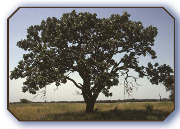
Bur oak in Minnesota

With the threat of new insect pests on the horizon, it is important to develop some additional selections of tall trees for the Northern Plains. One of the more widespread tall trees native to our region is the bur oak. Bur oak is a drought-resistant, long-lived tree. It has a moderate growth rate. In the early 1990s, the SCS field office personnel of the Great Plains made collections of bur oak seed. In 1993, selected seedlings from 90 seed sources were planted in eight blocks, in a nursery at the ARS Research Lab at Mandan, North Dakota. The soils on this site are a Parshall fine sandy loam. The area was fenced to keep out the deer. After 15 growing seasons, the trees were measured in 2007. The seed source with the tallest trees was from Cass County, North Dakota. The trees measured almost 20 feet tall.