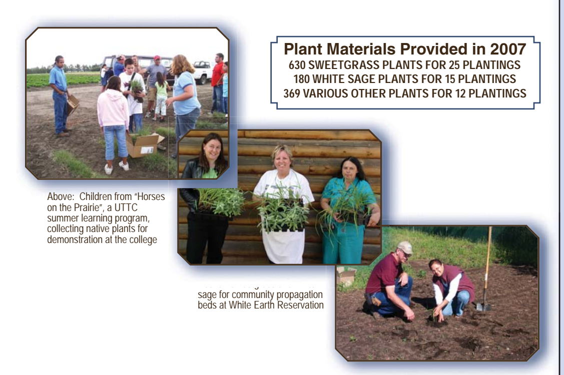
prepared site at Prairie Island Reservation