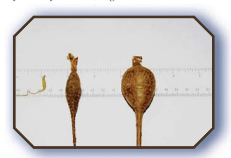
Tuber size after 1, 2, 3 years

Potatoes are not the only tubers growing in the Northern Great Plains. Indian breadroot, a native legume with a tuberous thickened taproot, can be found growing on dry prairies, bluffs, valleys, and open woodlands. Indian breadroot, also known as prairie turnip, was an important food source for the Great Plains Indians. They pulverized the root into flour or ate it raw or cooked. The PMC planted a small plot in October of 2004 to study the growth of prairie turnip. Seed was planted with a mix of grass to closely mimic the prairie. Plants were very slow to grow the first year. The second year (2006) plants flowered and root growth increased. In 2007, numerous plants set seed and root growth was excellent. A study