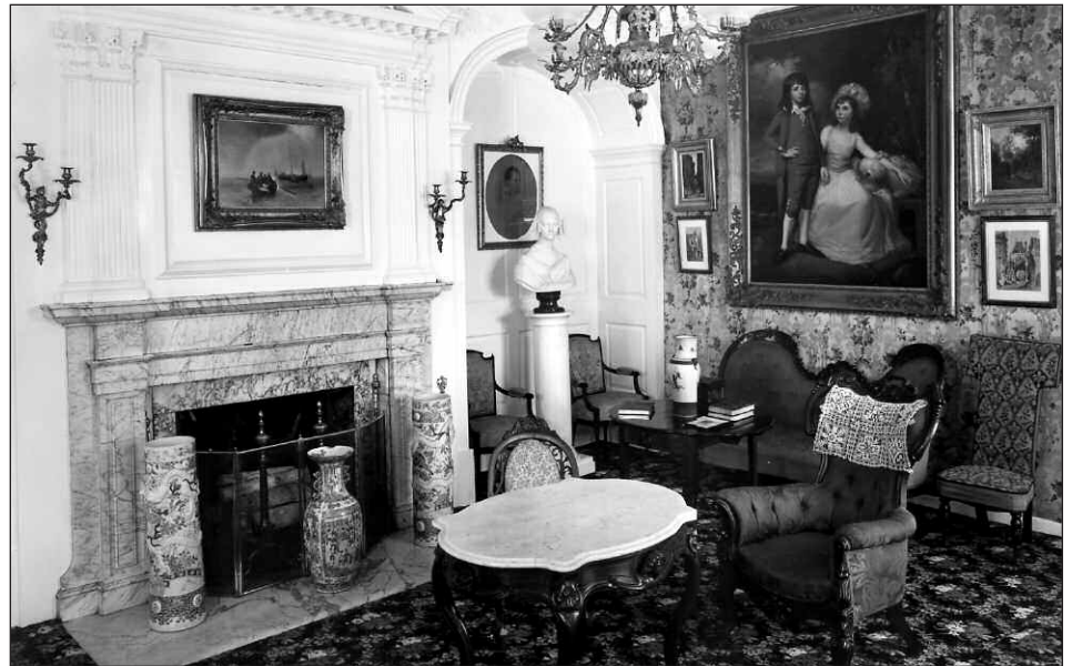
The Longfellow House parlor as it looks today

The carriage house exterior will be left intact, but the interior will be renovated to