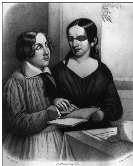
Laura Bridgman (right) with Oliver Caswell

Henry Longfellow. In 1852, she wrote expressing her pleasure on reading Evangeline as it was spelled out to her in the palm of her hand. Charles Dickens, on one of his American tours, traveled to Boston to visit with this young woman whose intelligence and character he remarked upon in his 1842 book American Notes .