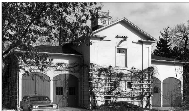
Photograph of the carriage house to the rear of the Longfellow House, 1972. Plans for its interior renovation are currently underway.