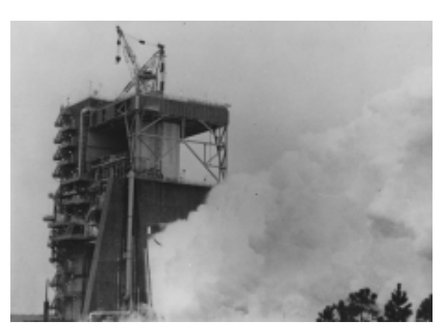
Saturn second stage acceptance test.

Following the August 1958 authorization to develop the Saturn I first stage, ABMA built the first eight vehicles in-house and then the Chrysler Corporation took over the work. With these measures, work on the S-1 proceeded quickly. Marshall began static firing of the first test booster on 28 March