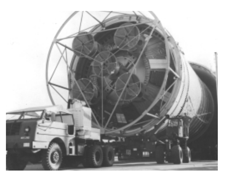
Saturn S–II stage arrives at Marshall.

Boeing remained at Marshall sites. Moreover early design and development occurred in-house at Marshall. There the Center directly managed Boeing's work, integrating contractor personnel into Marshall teams and only gradually giving