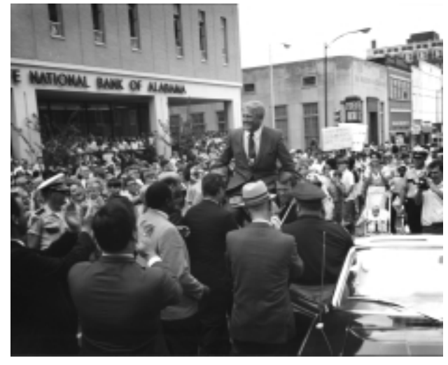
Celebration in downtown Huntsville of Apollo 11 landing.

phenomenon, as if all of the huge Saturn itself had begun silently to levitate." The engine's bright blaze initially coursed along the ground in "brilliant yellow bloomings of flame," and after the Saturn rose above the launch tower, its "fire was white as a torch and as long as the rocket itself." When the sound reached Mailer, he heard "the thunder-