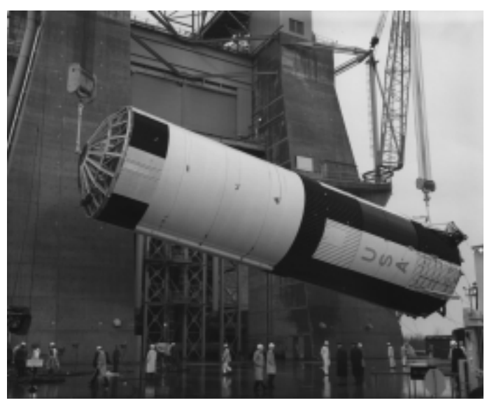
Installing S-IC-T stage in S-IC Test Stand in March 1965.

add a fifth engine. Marshall's robust rocket structure with heavy crossbeams made addition of the fifth engine possible. The lifting capacity of five engines would prove invaluable when the weight of Apollo p a y l o a d s i n creased.<sup>17</sup>