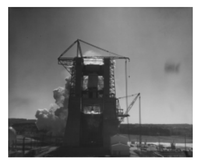
First S-IC full five engines firing on 16 April 1965.

Test structures for the stage and its engine cluster were also gigantic. The S–IC Test Stand, first used by Marshall's Test Laboratory in April 1965, had a super-