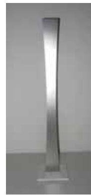
Ellsworth Kelly, Maquette of Totem, 2006