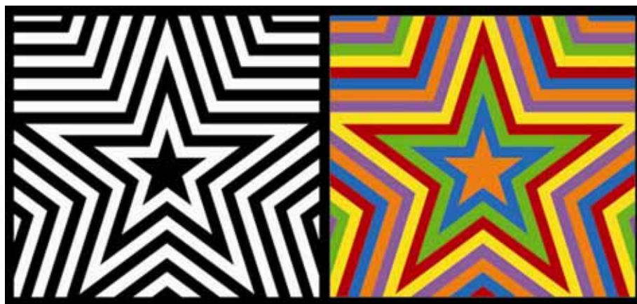
Sol LeWitt, Maquette of Wall Mural, 2004; © Sol LeWitt