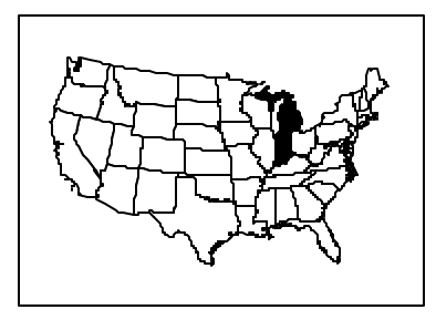
The Mitchell's satyr is a rare butterfly that is now found only in Michigan and Indiana.