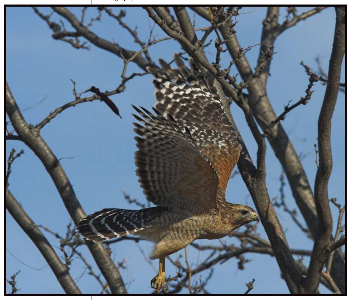
Raptor Information Sheet - Gyrfalcon

Map: The Peregrine Fund