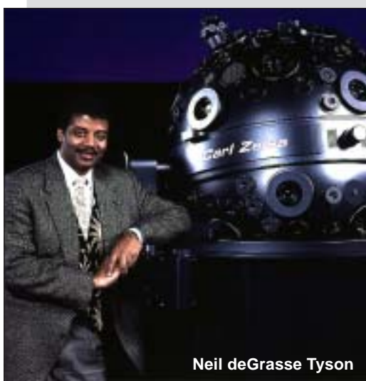
Neil deGrasse Tyson

N eil deGrasse Tyson, an astrophysicist and the Frederick P. Rose Director of the Hayden Planetarium at the American Museum of Natural History, will give a BSA Colloquium on "Destiny in Space?" at Berkner Hall on Tuesday, July 15, at 4 p.m.