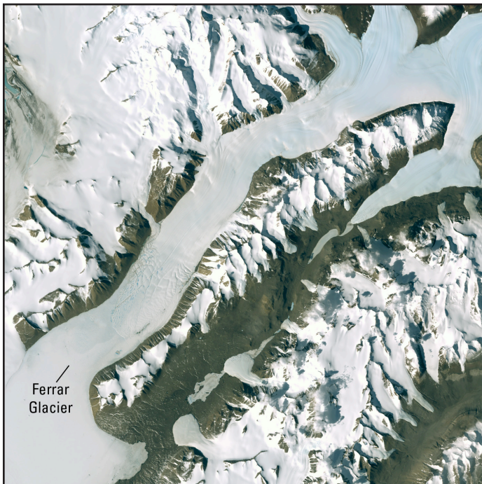
Enlargement of Ferrar Glacier area from the LIMA image on the front page. Top left to bottom right--Royal Society Range, Ferrar Glacier, Kukri Hills, Taylor Valley, and Asgard Range.

From the Antarctic Web portal, scientists and the general public will be able to download the mosaic and all of the original 1,065 hand-selected Landsat scenes used to create the mosaic. These scenes are some of the more than 8,000 scenes collected from 1999 through 2006 by the Enhanced Thematic Mapper Plus (ETM+) sensor onboard Landsat 7.